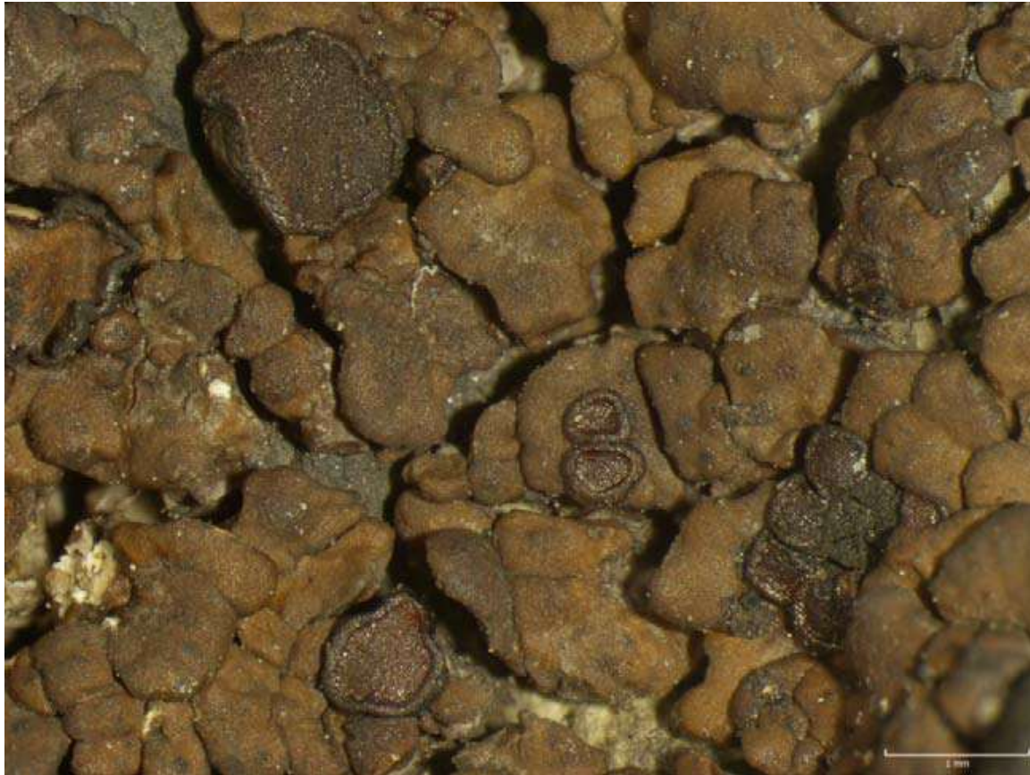
Acarospora boulderensis .