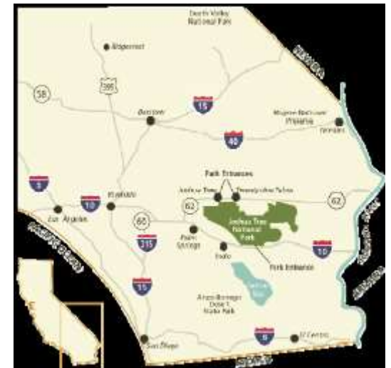
Location of Joshua Tree National Park in Southern California