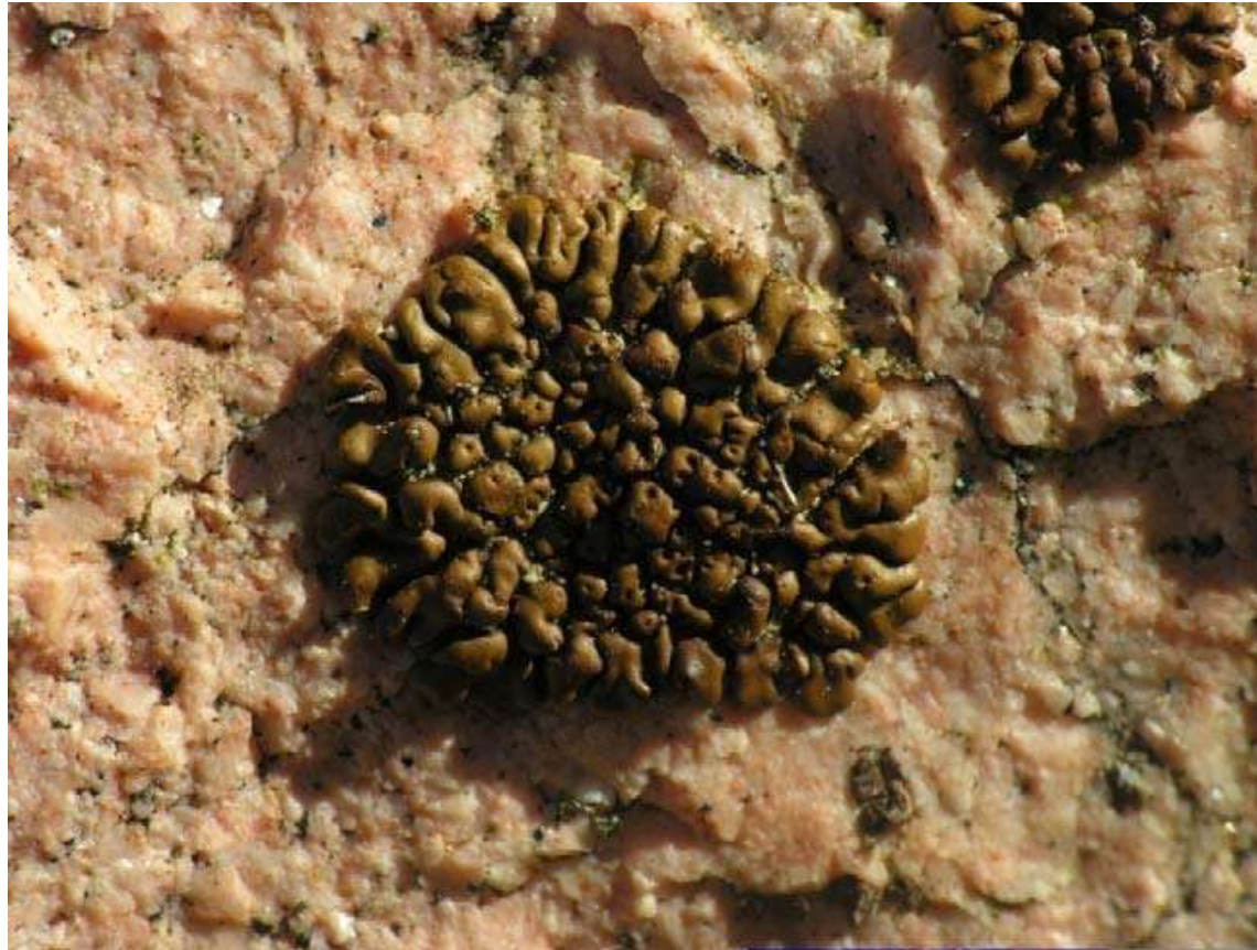
Acarospora rosulata .